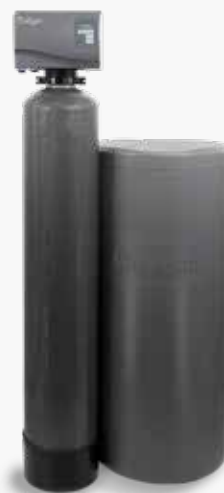
Aquasential® Select Plus Series & Select Series Water Softeners