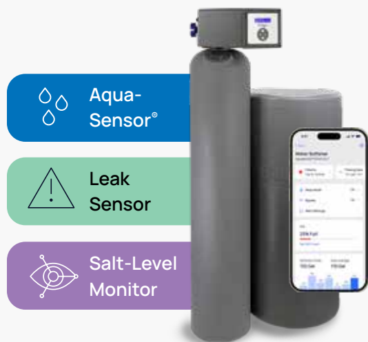
Aquasential® Smart HE Water Softener

1. Water Quality Research Foundation/Batelle Memorial Institute. 2. Water Quality Research Foundation/Scientific Services S/D, Inc.