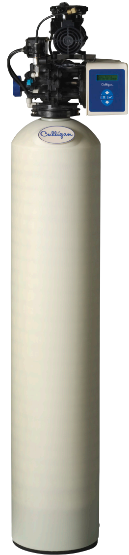
optional Quadra-Hull Tank shown